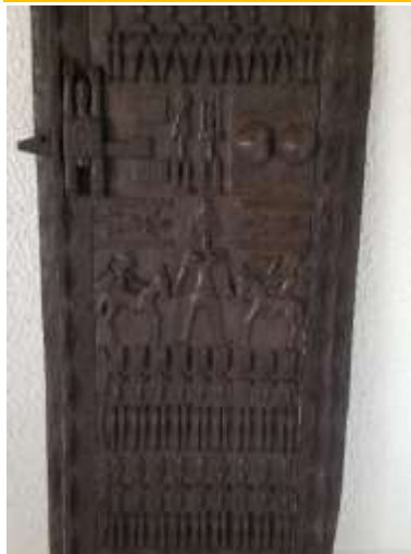
By Unknown Artist Wood