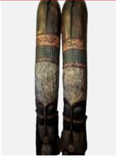
By Unknown Artist Mask ~210