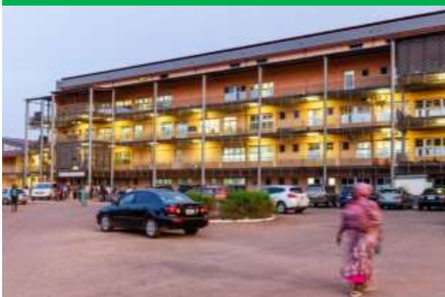
Tamale Teaching Hospital - Phase II