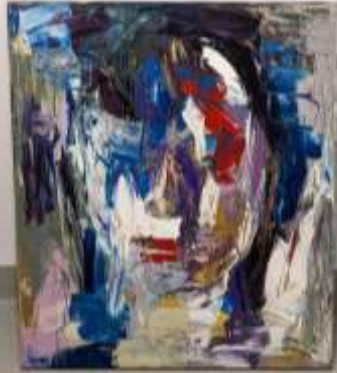
By Maxwell, Bubiashie, Accra Canvas 91x80x2