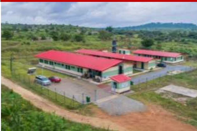
Gomoa Potsin, Central Region (10 Polyclinics Project)