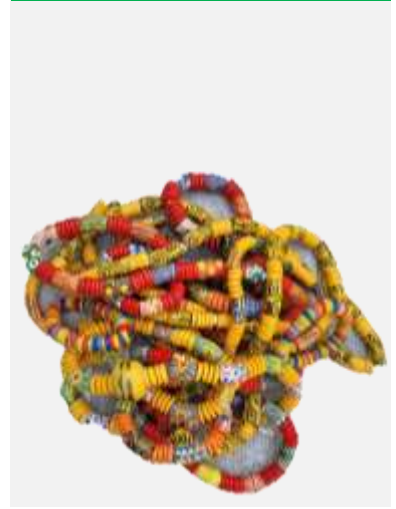
By Unknown Artist Beads