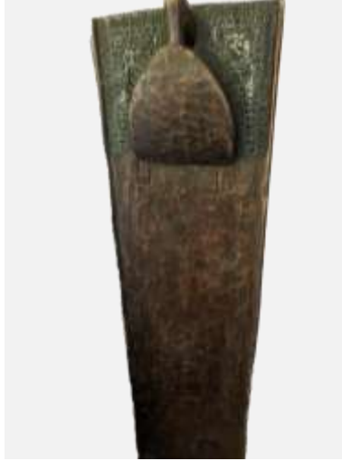
By Unknown Artist