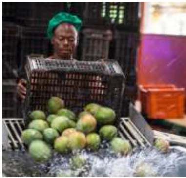
Agriculture & Agro-Processing

Priority sectors of the CARES programme and for the Ghana Investment Promotion Centre (GIPC) in this regard are: