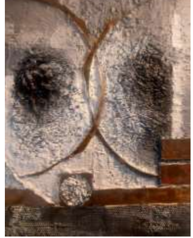
By Solomon Okpurukhre