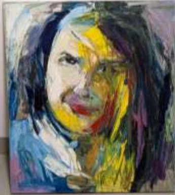
By Maxwell, Bubiashie, Accra Canvas 91x80x2