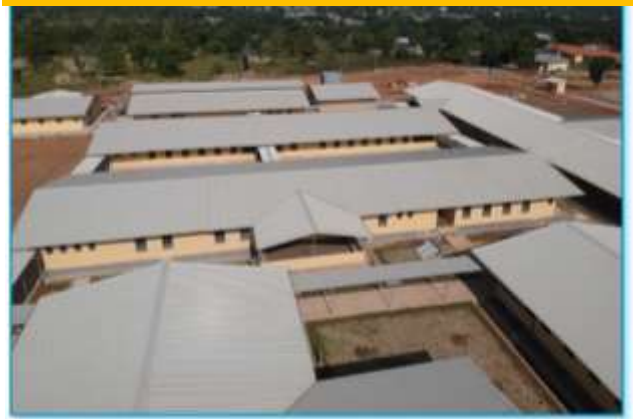
Sawla District Hospital, Northern Region