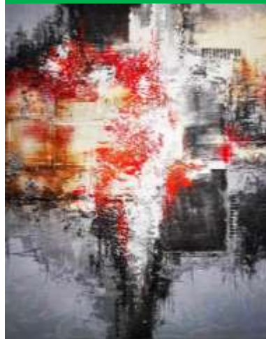
By Solomon Okpurukhre