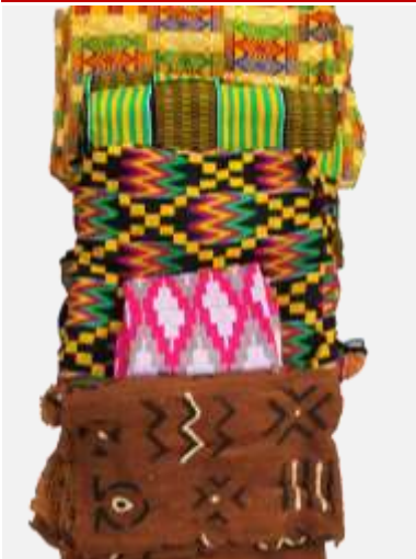
By Unknown Artist Fabric